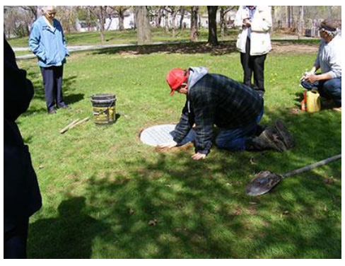
Employees of Solon Granite Memorial Works Inc. lay the new memorial stone.

"It is with great joy that I send this letter to you. I have proposed your intention to our Leadership Committee members and your proposal of a plaque has been overwhelmingly approved. The good works performed by your sisters in the past years will be kept alive on our hallowed grounds. May you be blessed for your commitment and continued service for the Lord."