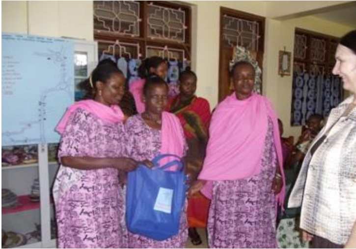
The Women are receiving teaching materials during the community health training Graduation