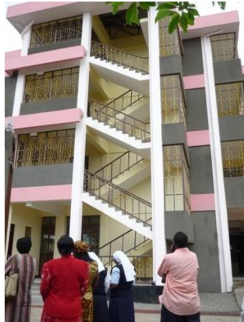
The guests look at the beautiful façade of the new boarding facility.

There was much joy and excitement when the girls arrived in January of 2014 to find that their new facility was ready for occupancy. Needless to say, everyone enjoyed watching these young women explore their new surroundings and begin to set up their dorms.