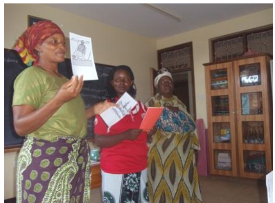
The women also practiced teaching the women's groups.

Within this short time the women's groups have prepared a skit on hygiene and presented it to about 250 women members on the occasion of the International Women's Day on March 22, 2014 here at our Zinduka Center. This shows how much interest they took to learn about health and their eagerness to educate others. They will continue to share this knowledge with others as they have been instructed.