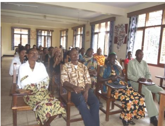
The young couples were given more knowledge on family planning.