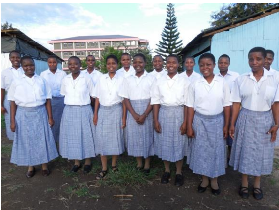
April 5, 2014 - Entrance to Postulancy

What a great joy to welcome 15 new members to our International Novitiate Community. These young women come from Uganda, Mozambique, Kenya and Tanzania.