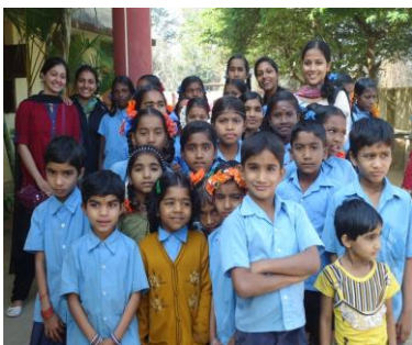
Rehabilitaion: Ashram school