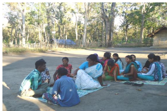
Interaction with Jenukuruba Tribals