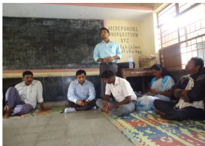
Interaction with Panchayta PDO